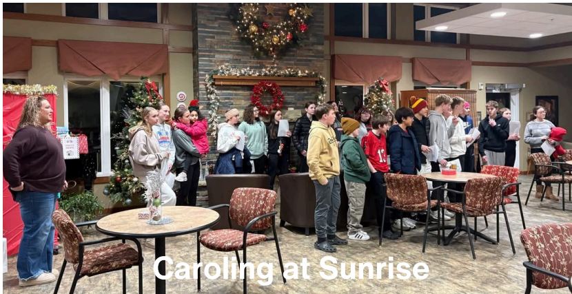
Caroling at Sunrise