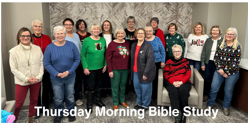
Thursday Morning Bible Study