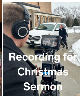
Recording for Christmas Sermon