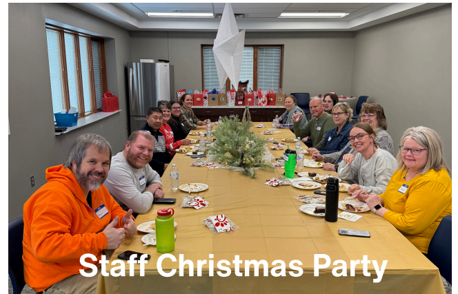
Staff Christmas Party