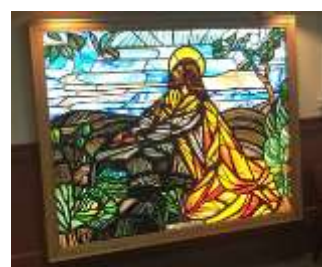
“Garden of Gethsemane Window”