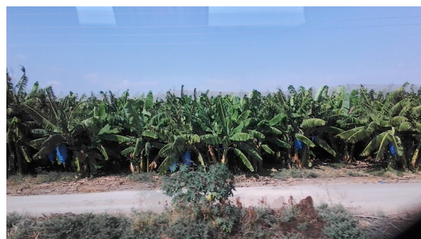
Blue bags protect bananas as it nears time of harvest.