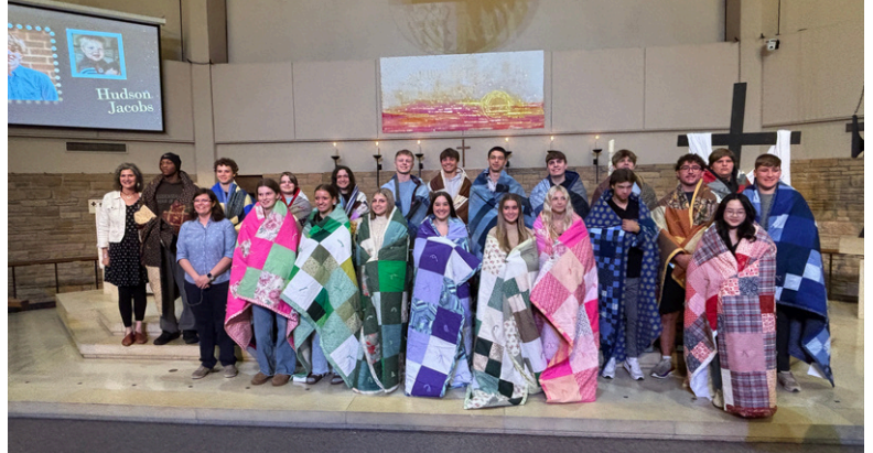
Class of 2025 CTK seniors wrapped in quilts made by CTK quilters,