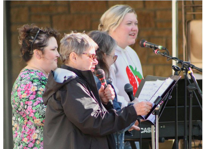
Singing prepares us to hear God’s Word.

Jesus asked his 12 disciples if they also wanted to go away. Peter answered him, “Lord, to whom can we go? You have the words of eternal life. We have come