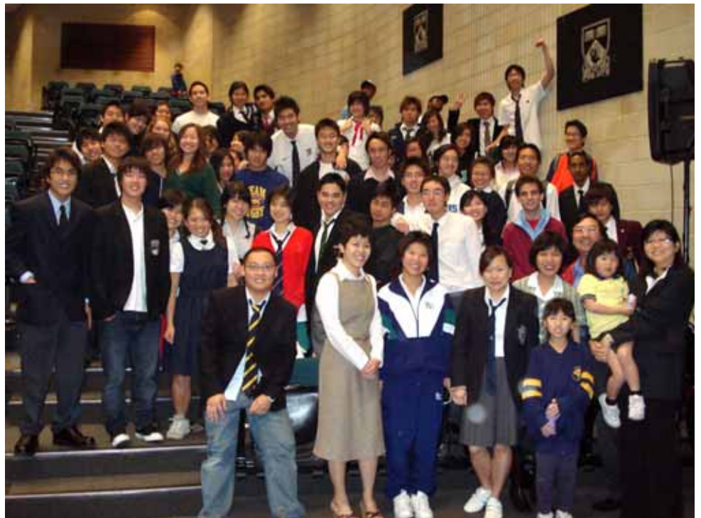
J-Life led a themed worship service on Saturday 15 September, where everyone was invited to dress up in their school day best!

Following a cracking worship session led by Amanda and the J-Life band (featuring a debut by Charis on the drums), the camp committee launched "Got Love?" – the theme for next year's camp – with a slightly off-centre skit (hey, it got the message through!).