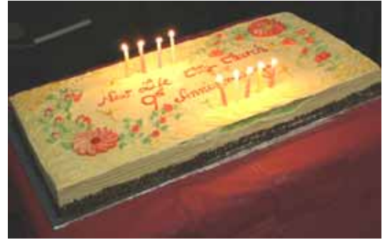
A giant cake, complete with nine candles!

It was truly an enjoyable day for the church. Our entire body made an effort to help and seeing how committed everyone was to NLCC made the lunch a successful and wonderful time for everyone – young and old! ■