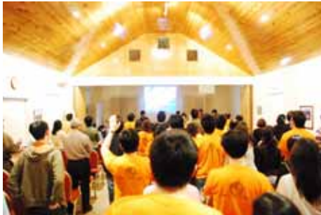
Worshipping in Orchard Glory Farm Resort's beautiful hall

The theme of the 2007 NLCC family camp. We almost expect camp to be the same each year: two sessions of the Word per day, some games, lots of food and a walk through the orchard for some fruit picking. But although the schedule and the framework for camp remains similar, God brings a different message each year.