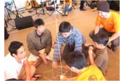
Games: challenging but fun!

about the end times and why it is so important for Christians to understand what is to come. He challenged us to katalambano .