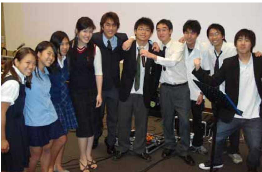
The J-Life band on the "School Day Best" themed service