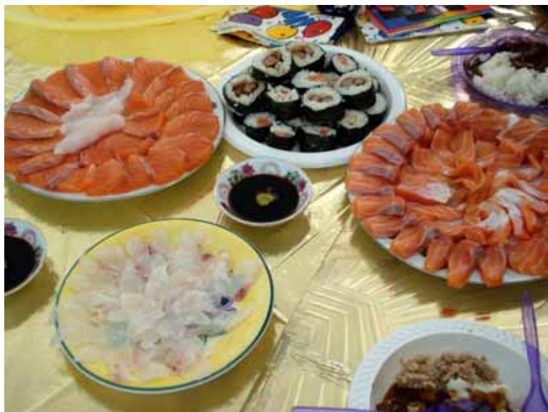
Sushi, sashimi ... you name it, we ate it!

Playing "Polar Bear" proved to be way harder than expected with so many people. So we gave up on that idea and decided to change movies to HAIRSPRAY! Laughing over particular scenes such as, "Doreen ..... Noreen!", it was indeed a laughter-filled few hours. With the beat being so contagious, the girls got into it and started singing and dancing along. 🎵