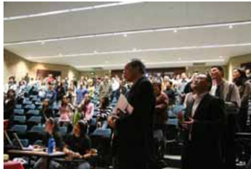
The NLCC congregation