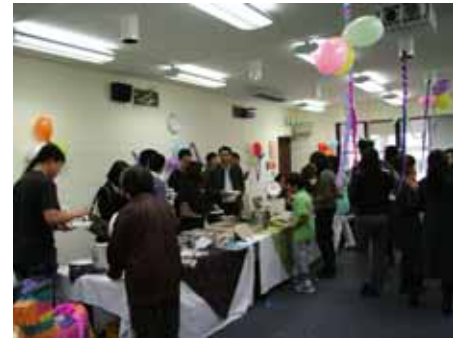
Colourful decorations and plenty of food!