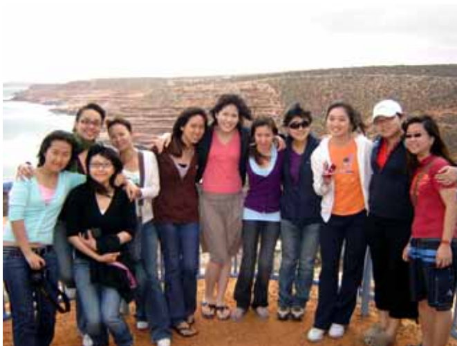
Our female road-trippers