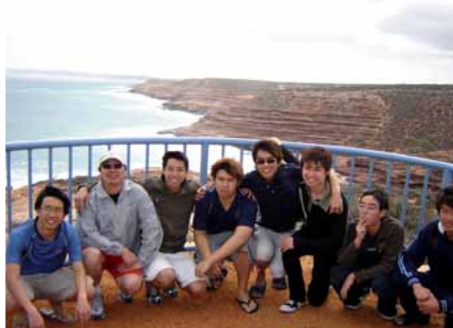
And the guys!