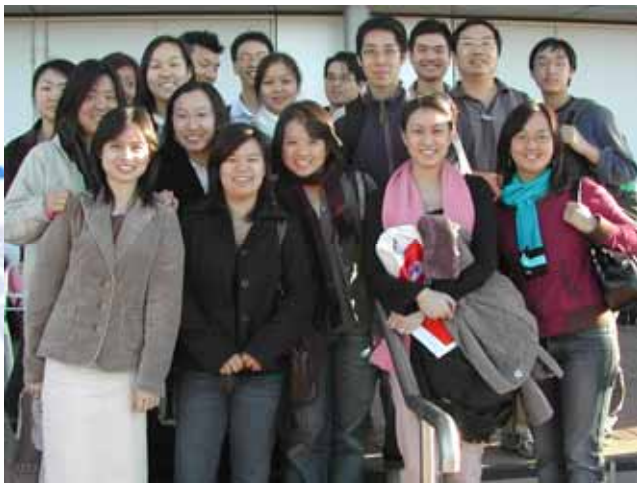
NLCC's Hillsong Delegates outside the Acer Arena