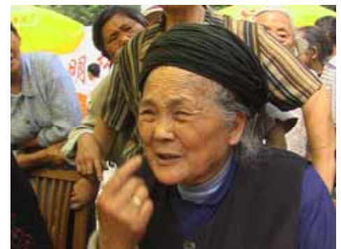
One of the more expressive patients

How can one not be moved? It’s experiences like these that make me realise if you have two hands, why wouldn’t you want to serve Him with all that you are and can?