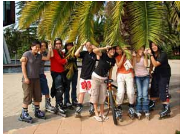
Rollerblading along the Swan River

So if you are aged between 13 and 18 and are not currently connected