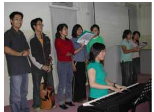
The worship team practices a new song

The next retreat will be later this year sometime in September. Watch this space, because it promises to be an even better and more inspiring worship retreat! ■