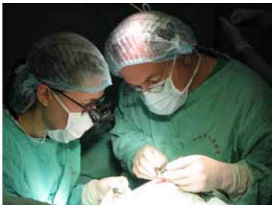
Surgeries in Cheng Du

The first day was spent meeting government officials, head of departments and other VIPs. Anything “international” in China is heavily overstated and publicly made aware of – for instance, we were greeted in one city with banners, marching bands(!), a salute by dancing