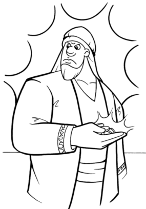
Parable of the Talents (Matthew 25:14-30)