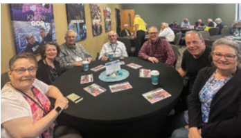
A breakfast was hosted by Greenwood Grace honoring senior ministers 65 and older.