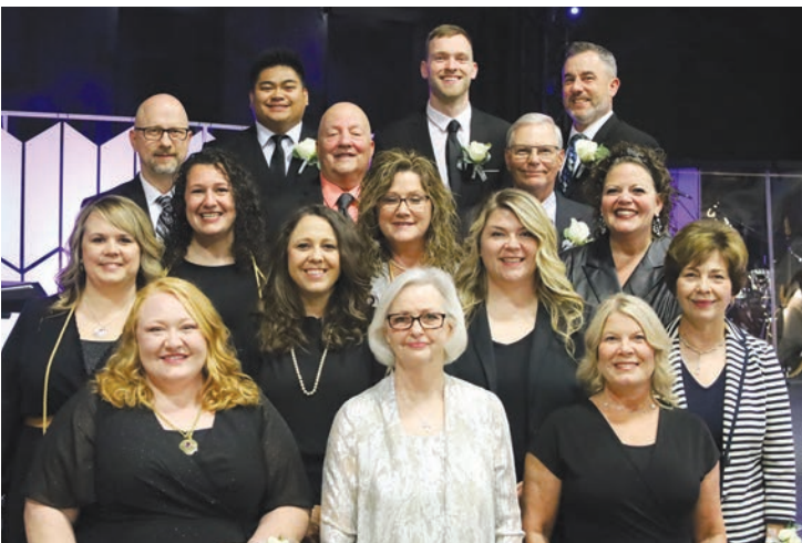
Ordination Class of 2023