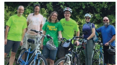
On Wednesday, May 24, ministers gathered for the 9th Annual Bike Ride for Missions and the 16th Annual Charles Crank Golf Outing.