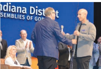
The Giffords were honored and presented with several gifts at the Monday night celebration.