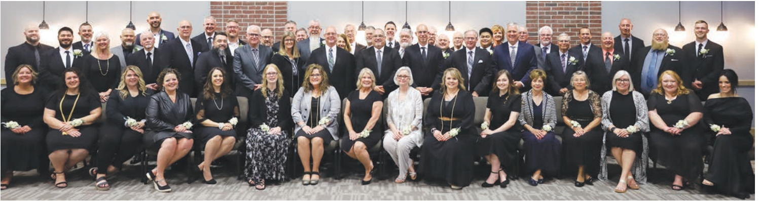
The 2023 Ordination Class with spouses and presbyters