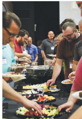
Several enjoyed the buffet at the Gifford celebration.