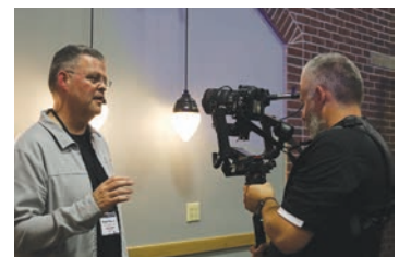
Several people recorded video messages to the Giffords.