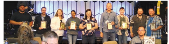
Leaders from the Top Ten STL giving churches