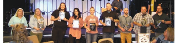
Leaders from the Top Ten BGMC giving churches