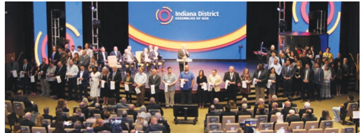
Licensed and certified ministers and Indiana School of ministry graduates were recognized at Tuesday night's ordination service.