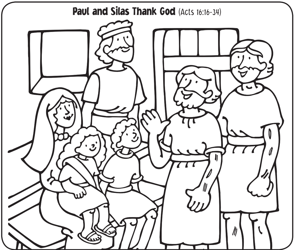
Paul and Silas Thank God (Acts 16:16-34)

Lesson 3 Today your child learned that WE WORSHIP GOD BY THANKING HIM . The children learned about people in the Bible story who were thankful even during difficult times. Children thanked God for all the good things in their lives.