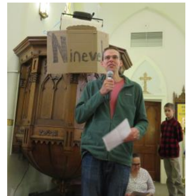
Youth Sunday—April 26, 2026