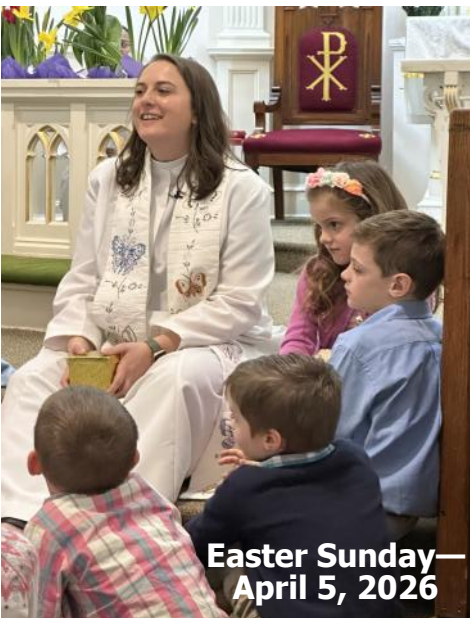
Easter Sunday— April 5, 2026