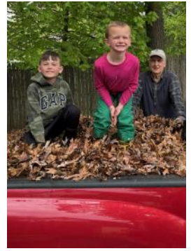
Property Spring Clean-Up Day—May 2, 2026