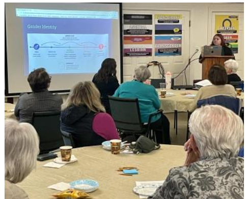
Gender & Sexuality 101: RIC Coffee Hour— May 3, 2026