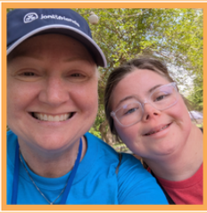
Missionary of the Month