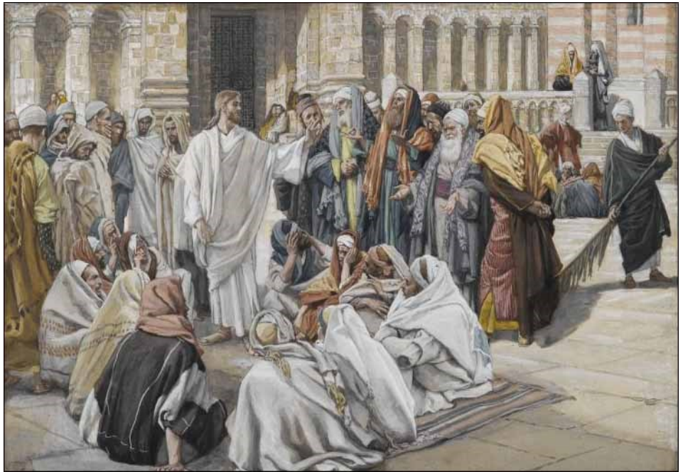
The Pharisees Question Jesus, watercolour by James Tissot, painted 1886-94