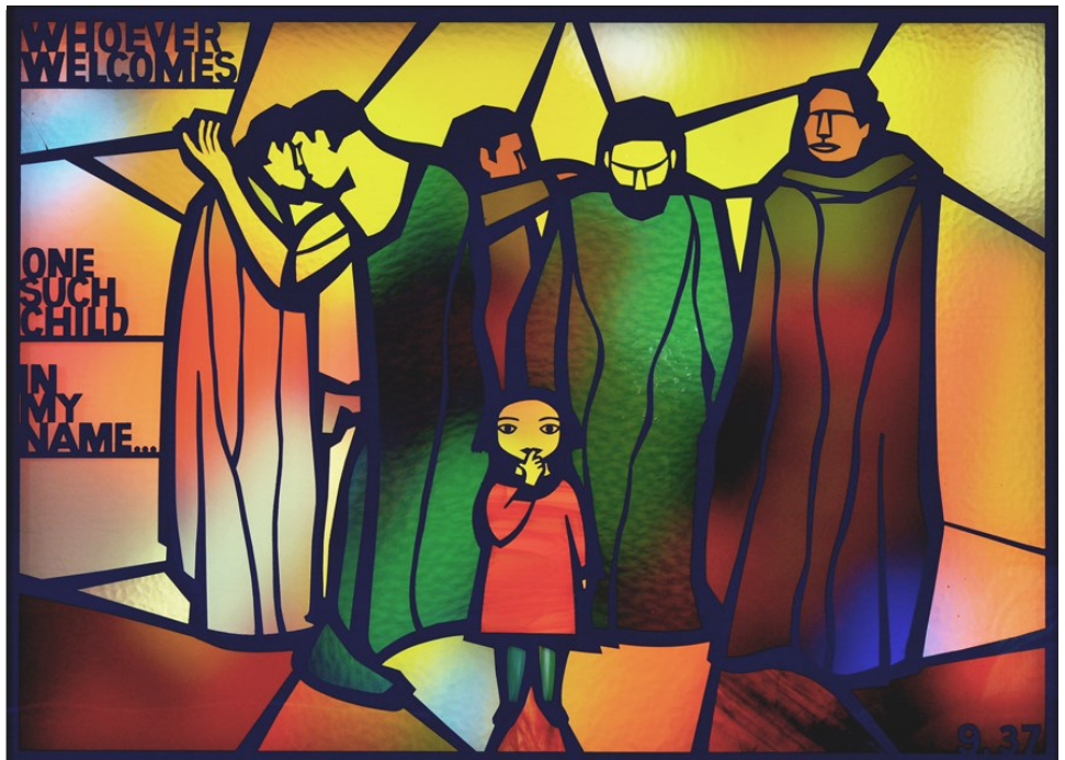
Athol Gill Screen (Stained Glass), Community Church of St Mark, Clifton Hill, Melbourne, Australia