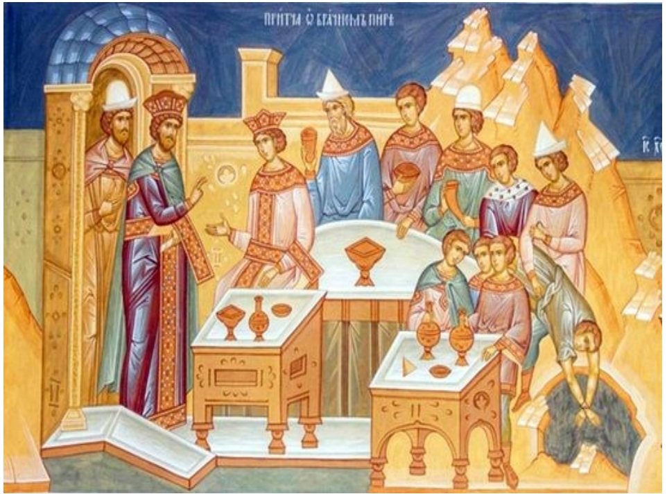
The Wedding Feast