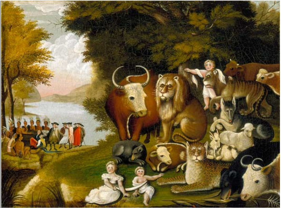
"The Peaceable Kingdom", Edward Hicks, 1826