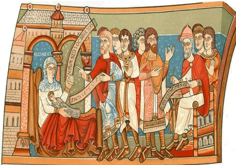
"Naming of St John the Baptist", a 12th-century wall painting in the crypt of Canterbury Cathedral