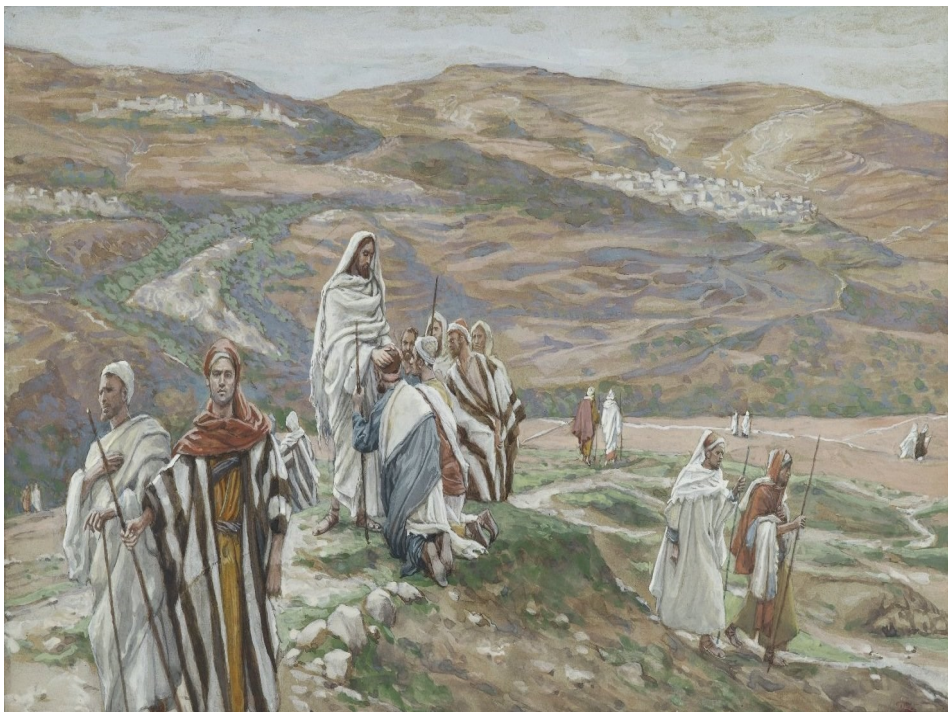
"Il les envoya deux à deux (He sent them out Two by Two)", James Tissot, 1886-1896