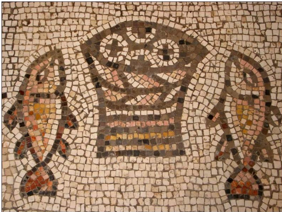
5th century mosaic in The Church of the Multiplication of the Loaves and Fishes, Tabgha, Israel