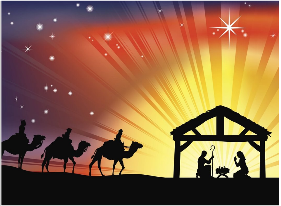
The Magi Approach