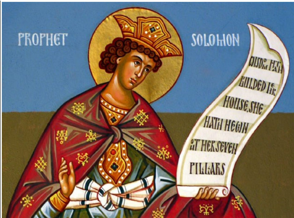
Orthodox Icon of King Solomon