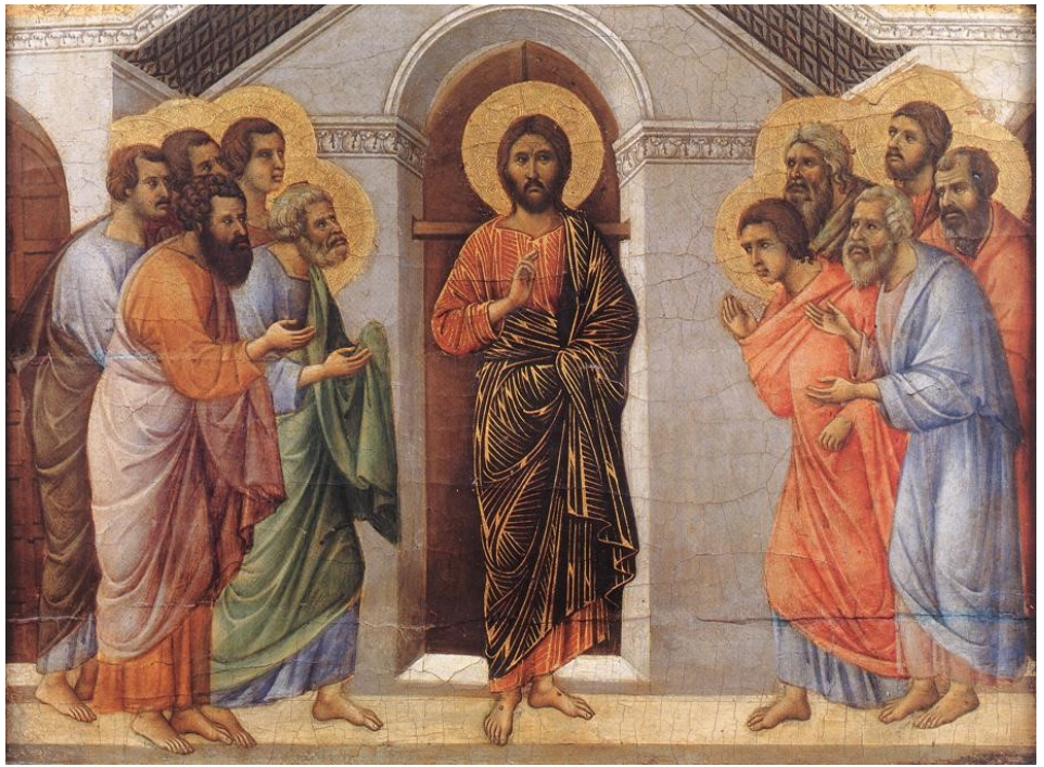
"Appearance Behind Locked Doors", Duccio Di Buoninsegna, 1308-1311