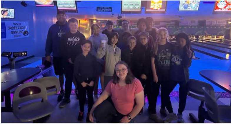
Outbreak - Late Night May 1, 2026