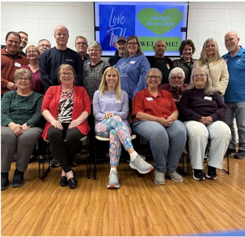
Marriage Nurture Night May 8, 2026