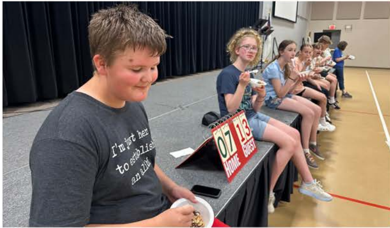
Outbreak - Kickball/Ice Cream May 27, 2026