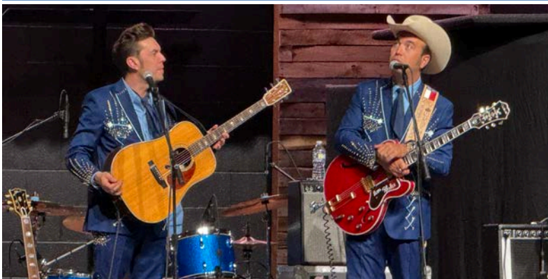
Bluegrass - Malpass Brothers April 17, 2026