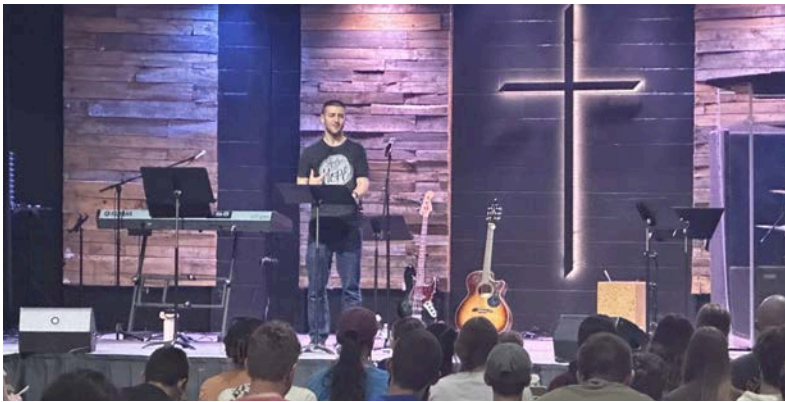
Quake - Common Ground April 12, 2026