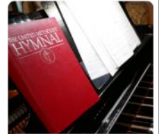
PARISH CHOIR REHEARSAL 2:00 PM