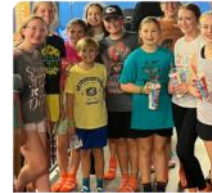
FUEL FOR THE SOUL 4-5:30PM Youth 6 th - 12 th Grade