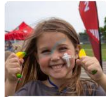
BLANKETS 4-5:30PM Kids 2yr - 5 th Grade

Join us this Sunday to experience peace, hope, and joy as we learn together.