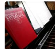
PARISH CHOIR REHEARSAL 2:00 PM