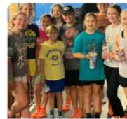
FUEL FOR THE SOUL 4-5:30PM Youth 6th - 12th Grade