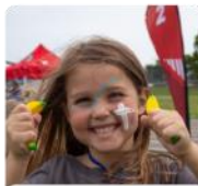
BLANKETS 4-5:30PM Kids 2yr - 5th Grade

Join us this Sunday to experience peace, hope, and joy as we learn together.