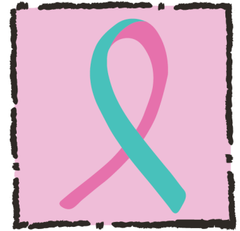
NW Region Breast & Cervical Cancer Project

The Northwest Region Breast and Cervical Cancer Project (BCCP) is a high-quality breast and cervical cancer screening and diagnostic program offered at no cost to eligible women in Ohio. In 2016, the Ohio Department of Health merged ten regions down to five, and we are now serving a total of 21 counties. Eligible women can still receive a no-cost pelvic exam, pap test, clinical breast exam, mammogram, and diagnostic testing if needed. A new component to the program in 2016 is Patient Navigation, which is offered at no-cost, and has no eligibility guidelines. Our patient navigators provide individualized support and assistance to help women overcome any barriers that may impede their access to breast and cervical screenings.