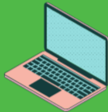
Computers / Laptops