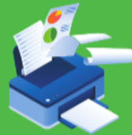
Printers / Scanners