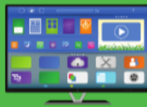
Flat Screen TVs