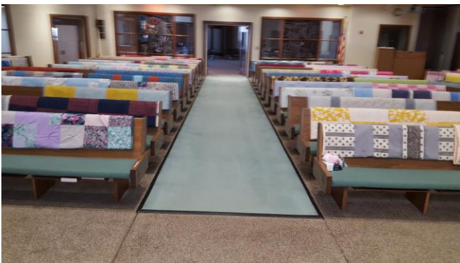
2023 LWR Quilts