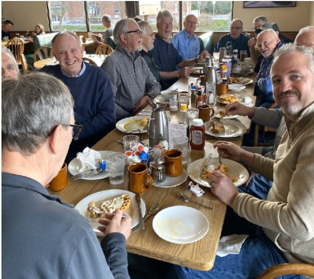
This men's group meets for breakfast twice a month. See page 17 for details.