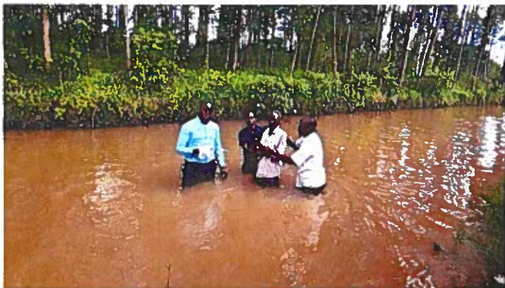
Beautiful baptism service!

PRAISE JESUS! 240 Bible have been distributed. Here the teens are learning how to read their Bibles.