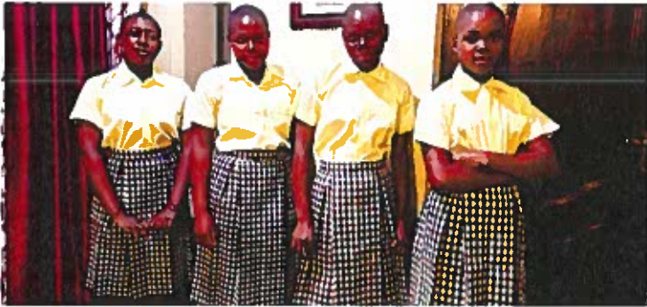
The school received new uniforms!