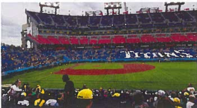
Savanna Bananas Baseball Game

If you know me, you know I love to travel - and I've been doing a lot of it lately! My family and I went on a vacation to Georgia, and then I tagged along with a close family friend for their trip to Nashville. Both were such sweet and refreshing trips.