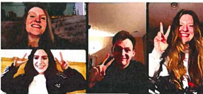
Book Club zoom meeting

Thanks so much for reading and being part of this journey - whether it's through prayer, support, encouragement, or simply staying in the loop. I'm really grateful for you!