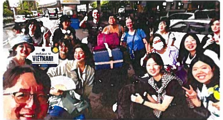
The WOL team in Vietnam for English camp!

Some of our team in South Korea recently headed to Vietnam to help partner with the Word of Life team there with some English camps for the youth of Vietnam. Please pray for the teams as they work together and that any of those who attend and don't know the Lord would meet Him as their Savior. Please also pray that everyone has safe travels and stays healthy!