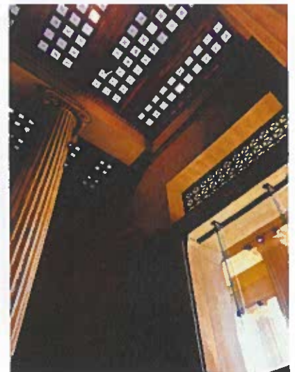
Views from Nashville