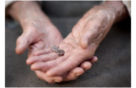
They Gave ALL They Had

ALL: I believe in one God, the Father Almighty, maker of heaven and earth and of all things visible and invisible. And in one Lord Jesus Christ, the only-begotten Son of God, begotten of His Father before all worlds, God of God, Light of Light, very God of very God, begotten, not made, being of one substance with the Father, by whom all things were made; who for us men and for our salvation came down