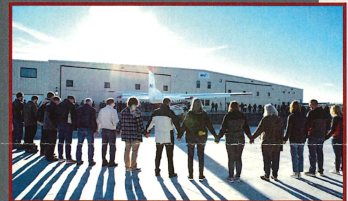
Dedicating Sandy for service to God