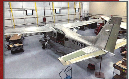
"Sandy" in our hangar