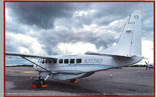
N717RD when we bought her

In a hangar where people work on major projects, some aircraft stand out for various reasons and may acquire a nickname. This one became known as "Sandy" in memory of the sanded rivets. Whatever she ends up being called, she will be a tremendous blessing to those she serves in Congo.