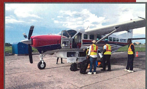
Upon arrival in the DRC