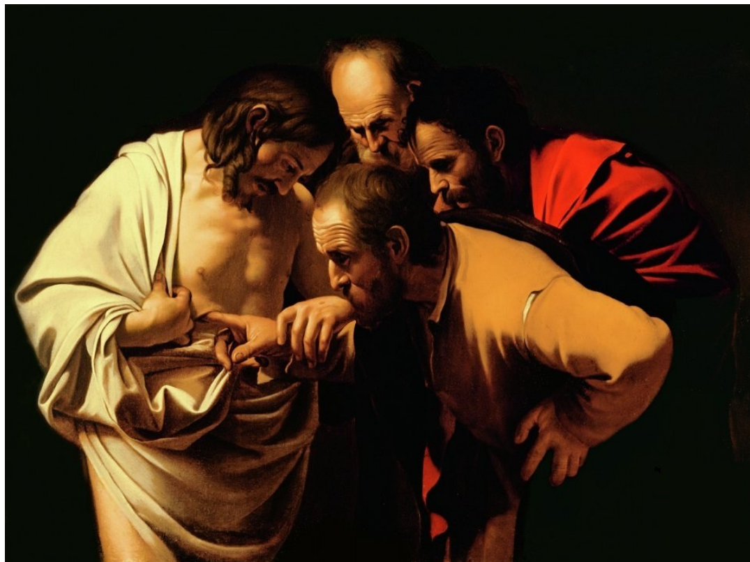
The Incredulity of Saint Thomas