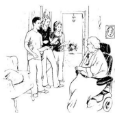
Guardian Angel Project

We will also enjoy other Brewer UMC Christmas traditions after their program including refreshments in the Fellowship Hall. Please bring some of your favorite finger-type foods to share.