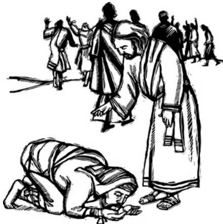
Jesus Heals 10 Lepers

Copyright © Sermons4Kids, Inc. May be reproduced for Ministry Use