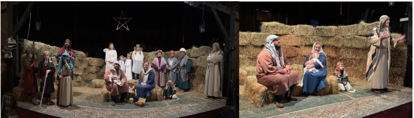
Christmas Eve Barn Service