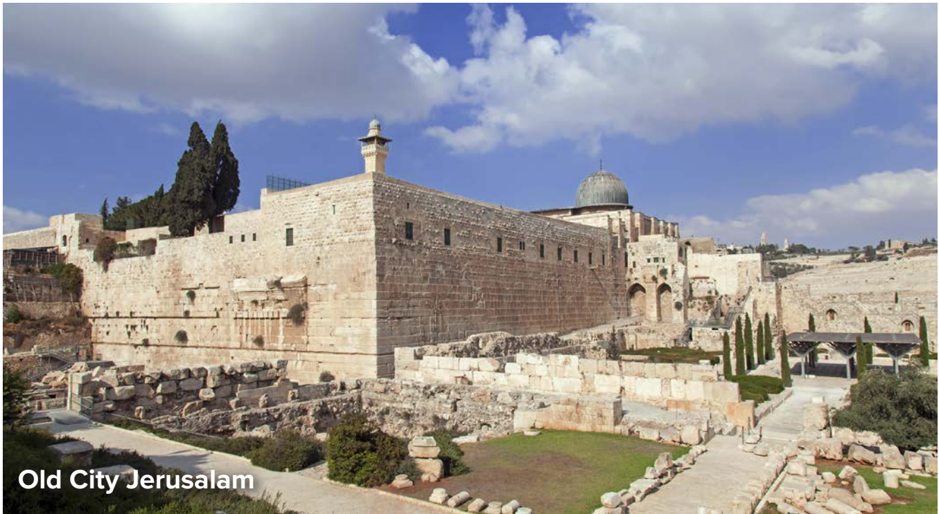
Old City Jerusalem