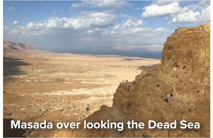
Masada over looking the Dead Sea