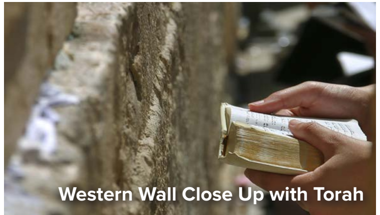
Western Wall Close Up with Torah