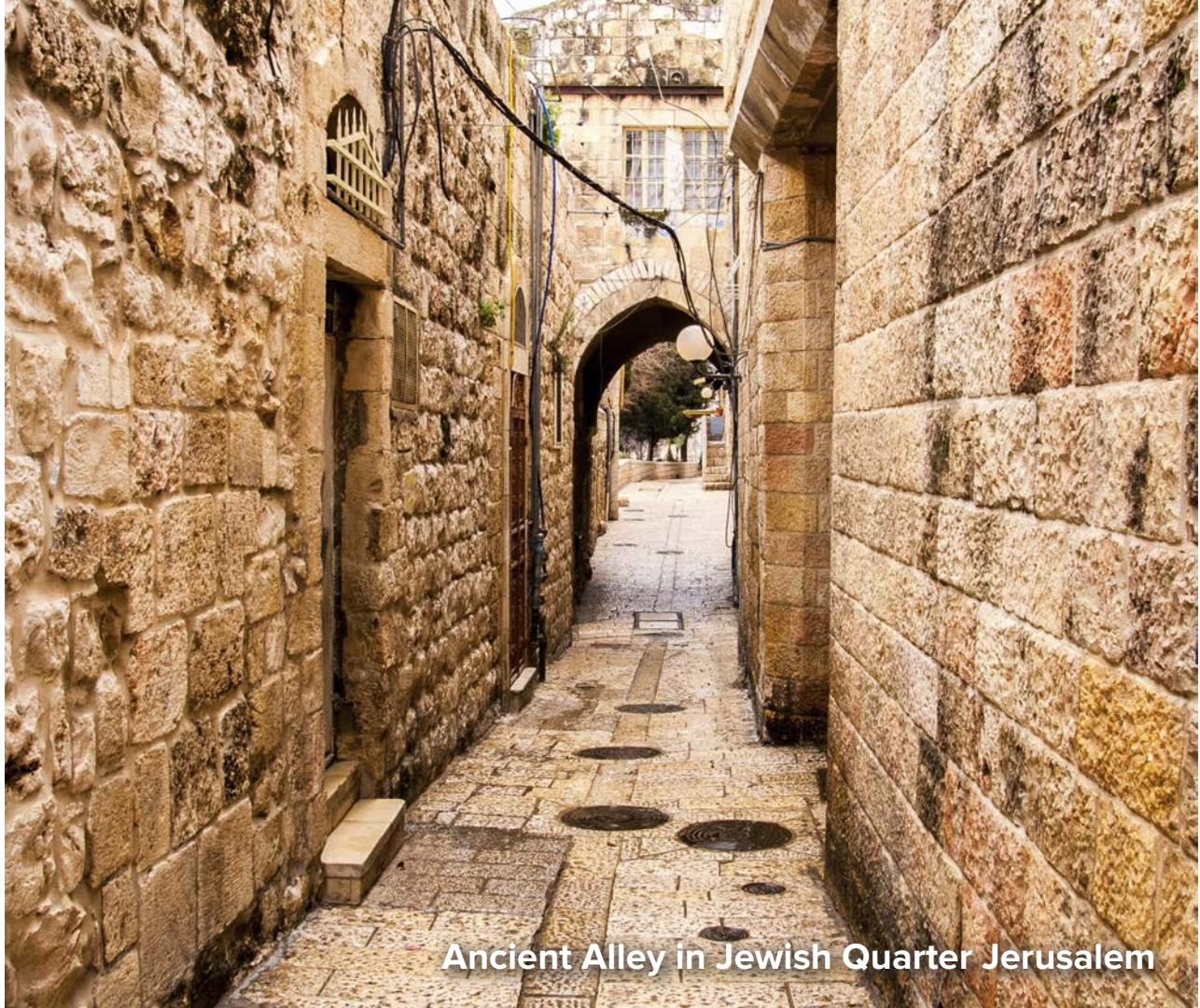
Ancient Alley in Jewish Quarter Jerusalem

We are glad you've considered participating in this exclusive Israel Holy Land Tour. The 2018 trip with Bridgeway Church will be a once in a lifetime experience that will change your understanding of the Bible and relationship with God. We are excited and can't wait to get started!