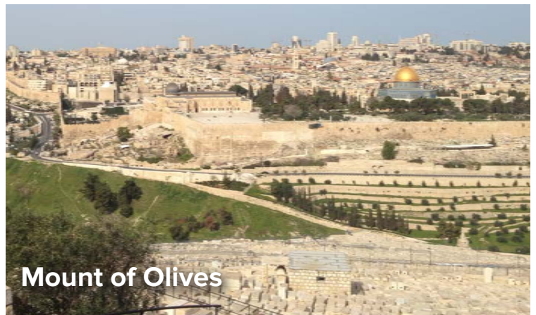
Mount of Olives