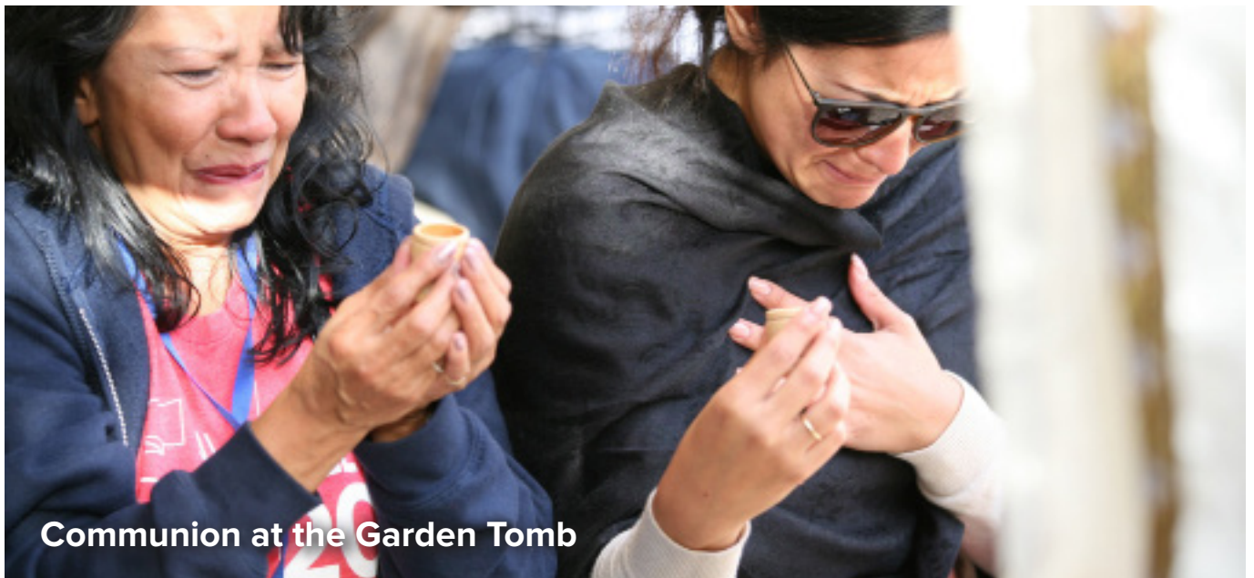
Communion at the Garden Tomb