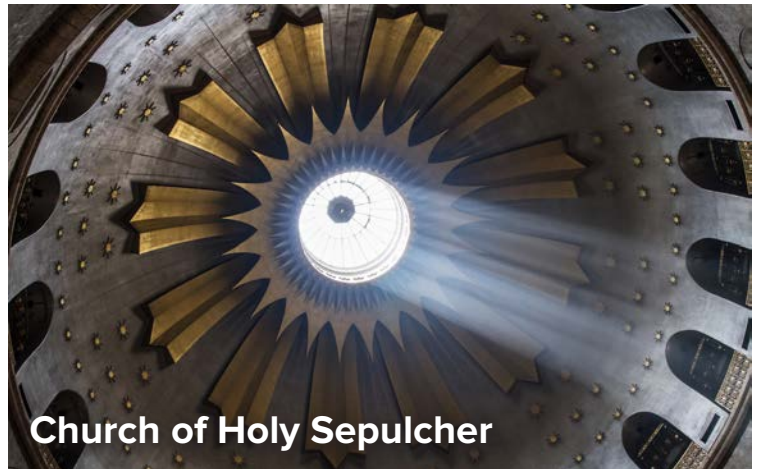
Church of Holy Sepulcher

Jerusalem, Dead Sea, Good Samaritan, Caesarea, Mt. Carmel, Armageddon, Nazareth, Sea of Galilee, Mt. of Beatitudes, Church of the Multiplication of the Loaves and Fish, Capernaum, Mt. of Olives, Chapel of the Ascension, Gethsemane, Caiphas' House, Last Supper Room, Communion at the Garden Tomb, St. Anne's Church, Pool of Bethesda, Pilate's Judgment Hall, The Ecce Homo Arch, Walk the Via Dolorosa to the Church of the Holy Sepulcher Old City Marketplace, Western Wall, Western Wall Tunnel, Shepherd's Field and Church of the Nativity, Qumran, Masada and many others.