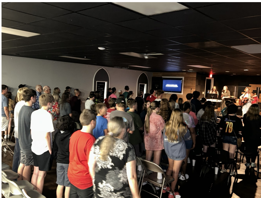
Youth Praise event hosted by Grace, Highland & Trinity Baptist churches.

Spiritual First Aid is partnering with Hope Made Strong and Mental Health & the Church Initiative at Biola's Rosemead School of Psychology to present a free one-day virtual event on October 10: The Church Mental Health Summit . Participants can learn from experts from around the world and be equipped with practical tools, biblically-based resources, and research-backed strategies for supporting mental health.