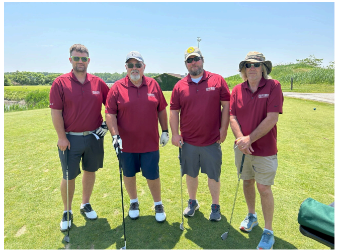
Jack's foursome supporting RCM's golf outing