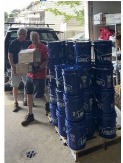
Last years delivery of our Buckets!

In January the Christ UMC Mission Committee is asking for your prayers and financial support to provide Cleaning Buckets for victims of disasters across the United States and around the World. The United Methodist Committee on Relief (UMCOR) assists victims of disasters by distributing the Cleaning Buckets. These supplies enable people to begin the overwhelming job of cleaning up after a flood, hurricane or other disaster. While they provide required supplies to start the necessary clean-up, they also provide Hope and a tangible sign that "we" care in their time of need. "We" are you and I, Christ UMC, UMCOR, and God. For in times of disaster, it is our hands that act as the hands of God. Please help support this vital mission financially and with prayers for all those in need of these tangible signs of Hope and Caring.