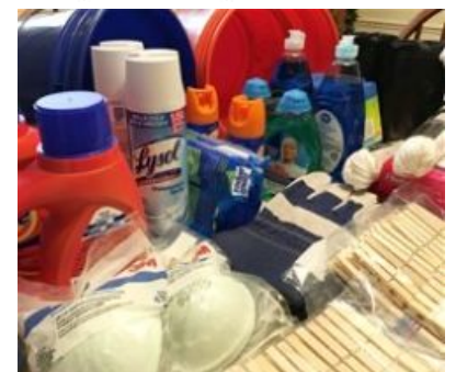
Contents of the Buckets