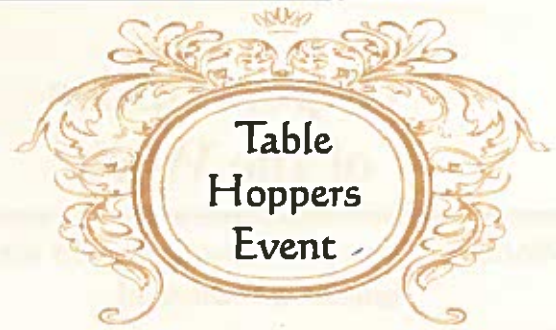
Table Hoppers Event

Sharing a meal with others not only nourishes us physically but also warms the soul and makes our heart glad. Breaking bread together enriches our lives by strengthening bonds of friendship and gives the opportunity to build new relationships.