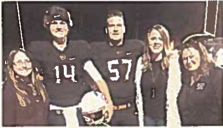
Some of the ECU Wesley football players with ECU Wesley family after the game on October 8th.