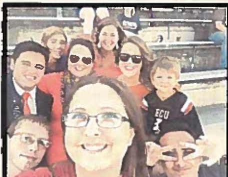
Students & ECU Wesley staff attended the Homecoming game on September 24.