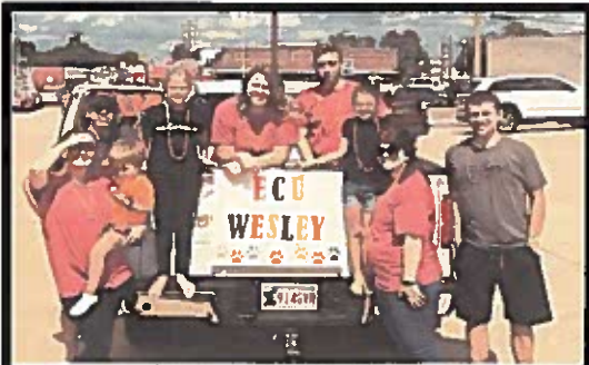
ECU Wesley participated in the Homecoming Parade on Saturday, September 24.

We want to say thank you to the Transformers Class for providing desserts for our lunch and the candy for the parade.