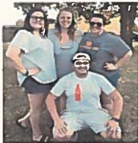
One of the teams that participated in the ECU Wesley Photo Scavenger Hunt & Snow Cones on Monday, August 15, 2016.