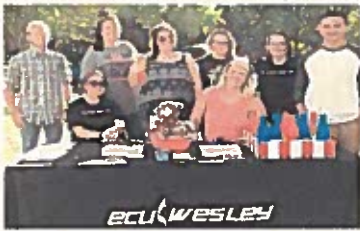
ECU Wesley was well represented at the Block Party on Sunday, August 14, 2016