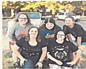
One of the teams that participated in the ECU Wesley Photo Scavenger Hunt & Snow Cones on Monday, August 15, 2016.