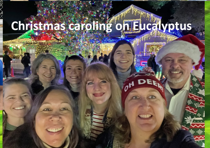
Christmas caroling on Eucalyptus