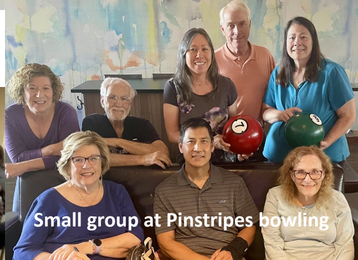
Small group at Pinstripes bowling