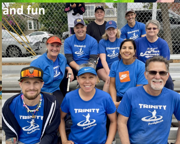
Trinity softball team celebrating fellowship and fun