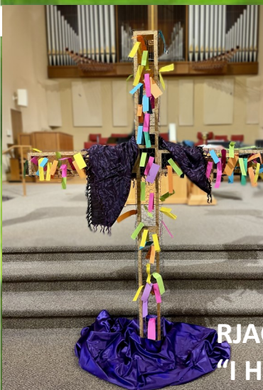
RJAG activity inspired by Dr. King's "I Have a Dream" speech