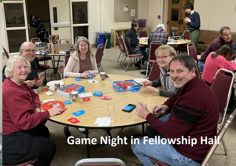
Game Night in Fellowship Hall