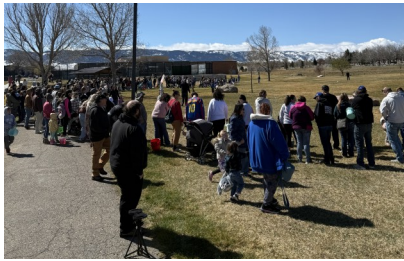
HBC/Boyd Community Easter Egg Hunt

Promotion Sunday —Will be on Sunday, June 7th. This is an exciting time of recognizing the spiritual growth of our children and youth!