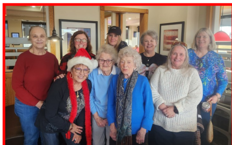
Ladies Christmas luncheon