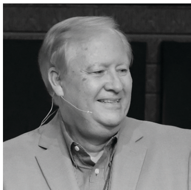
Alan Shelby Harvest Baptist Church