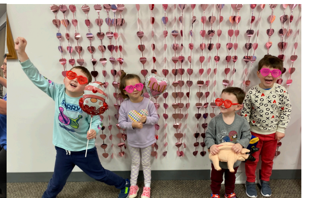
February 3 we hosted a Cookies & Faith event for preschooler and their families, where they frosted cookies and posed for pictures.