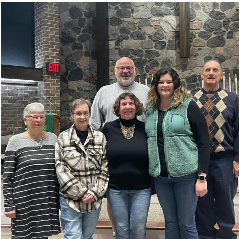
Council Installation on January 21, 2024