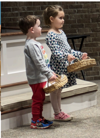
The Newport kids helping with communion.