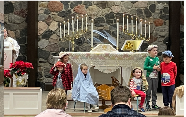
During our first service on Christmas Eve, we had an impromptu Christmas pageant with children and adults participating.