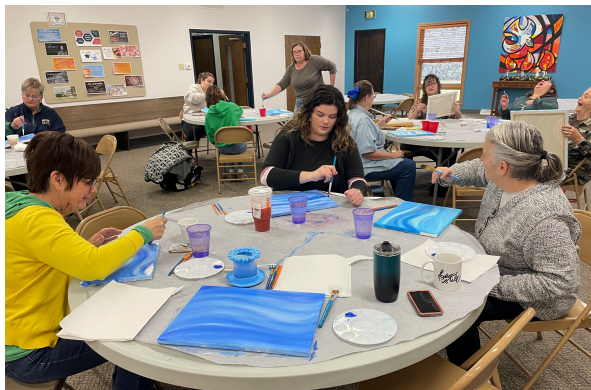
Paint with Pastor event on January 27, where artists painted a mittens hanging on an evergreen branch.