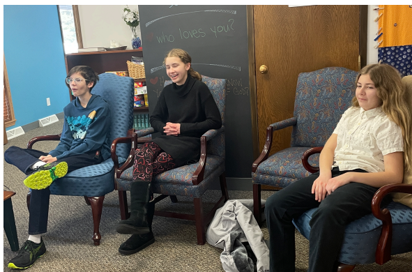
Some of our confirmation students as they learned about the Lord’s Prayer.