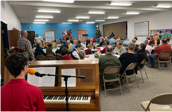
On December 10th we “went” Christmas Caroling during worship, as we sang old carols and learned their history.