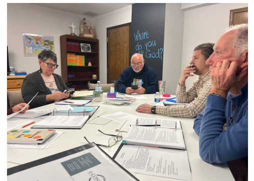
The E-Connect team working on developing our training session for the leaders.