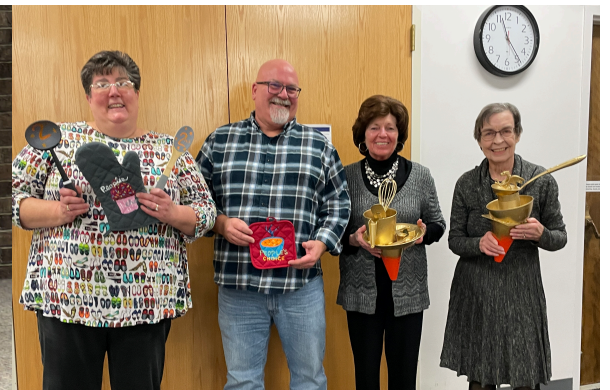
The winners of our Soup & Dessert Cook-off on January 28. We raised $800 for Soup of Success.