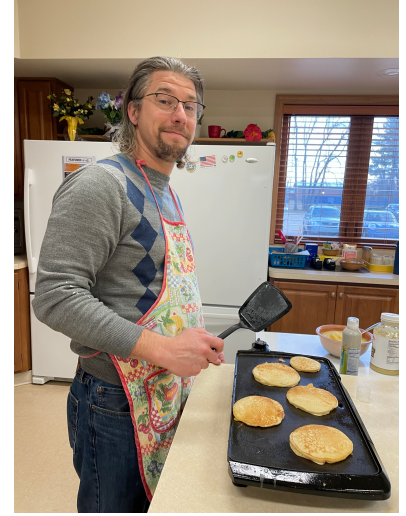
On February 13 we had our Shrove Tuesday Pancake Supper, where we raised money for the Leadership students at Model Elementary.