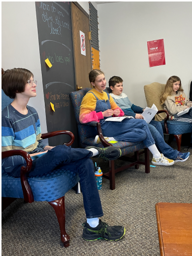
Our confirmation students learning about the sacraments of Holy Baptism and Holy Communion at their last class.